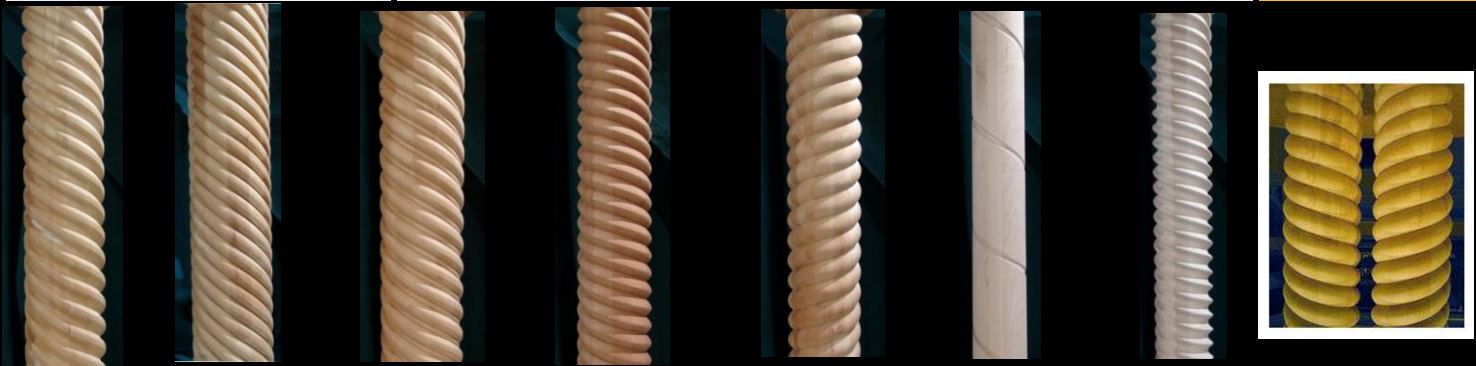
Atlanta Barley Carousel Casino FrenchCountry SanFrancisco Swiss Specify Left or Right