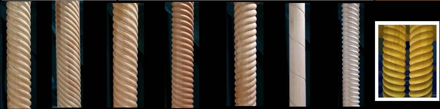
Atlanta Barley Carousel Casino FrenchCountry SanFrancisco Swiss Specify Left or Right