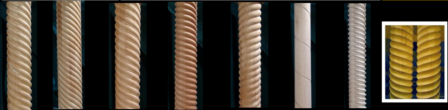
Atlanta Barley Carousel Casino FrenchCountry SanFrancisco Swiss Specify Left or Right