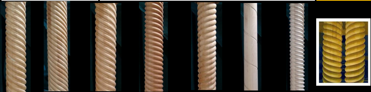
Atlanta Barley Carousel Casino FrenchCountry SanFrancisco Swiss Specify Left or Right