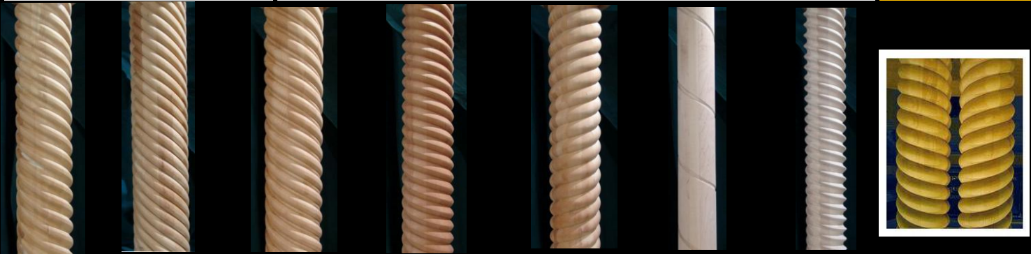
Atlanta Barley Carousel Casino FrenchCountry SanFrancisco Swiss Specify Left or Right