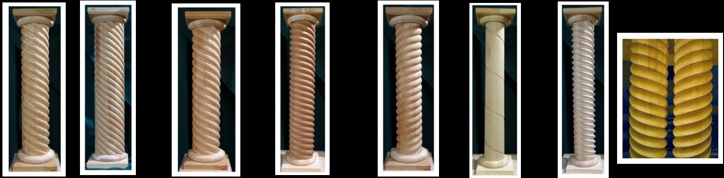
Atlanta Barley Carousel Casino FrenchCountry SanFrancisco Swiss Specify Left or Right