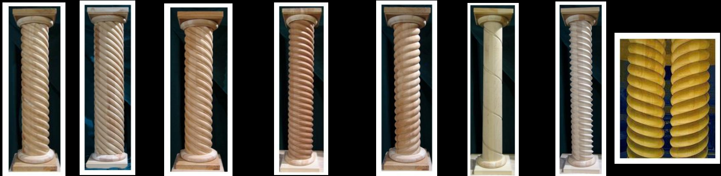
Atlanta Barley Carousel Casino FrenchCountry SanFrancisco Swiss Specify Left or Right