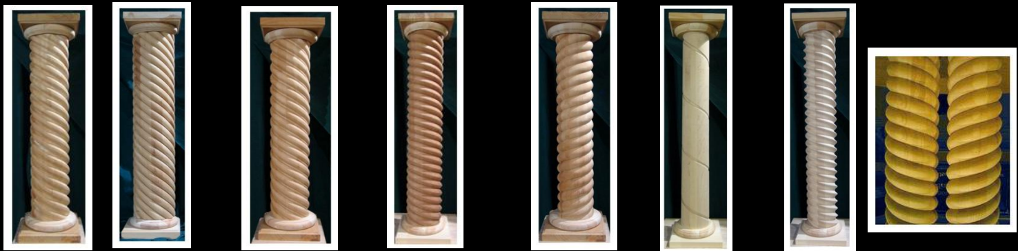
Atlanta Barley Carousel Casino FrenchCountry SanFrancisco Swiss Specify Left or Right