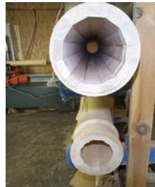
Staves 1-1/2" (3.8cm)

Taper: The entasis creates a visual distortion for perspective. The taper starts at the top of the shaft under the astragal 2/3rds down the shaft (H) bottom 1/3 straight