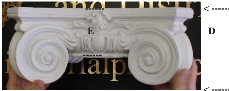
<----- F) Width of Scrolls ----->